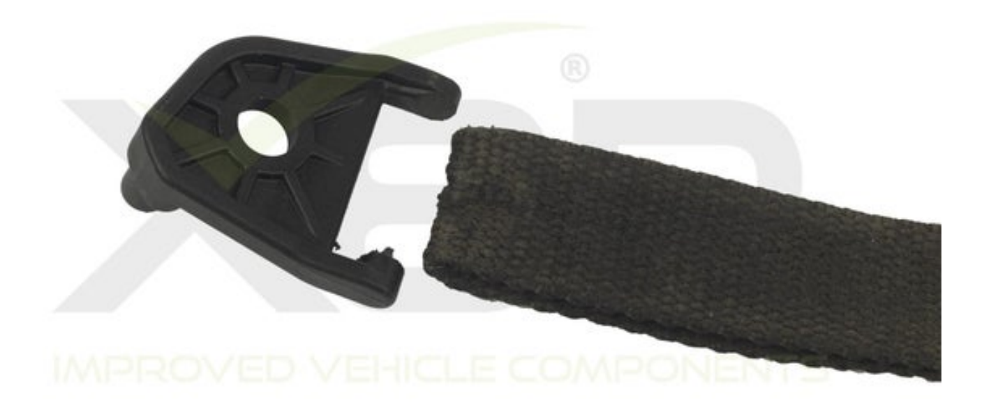
Step 3: Fit Strap to X8R Lever

Slide the pin into the strap and lever, then tighten with the Allen key.